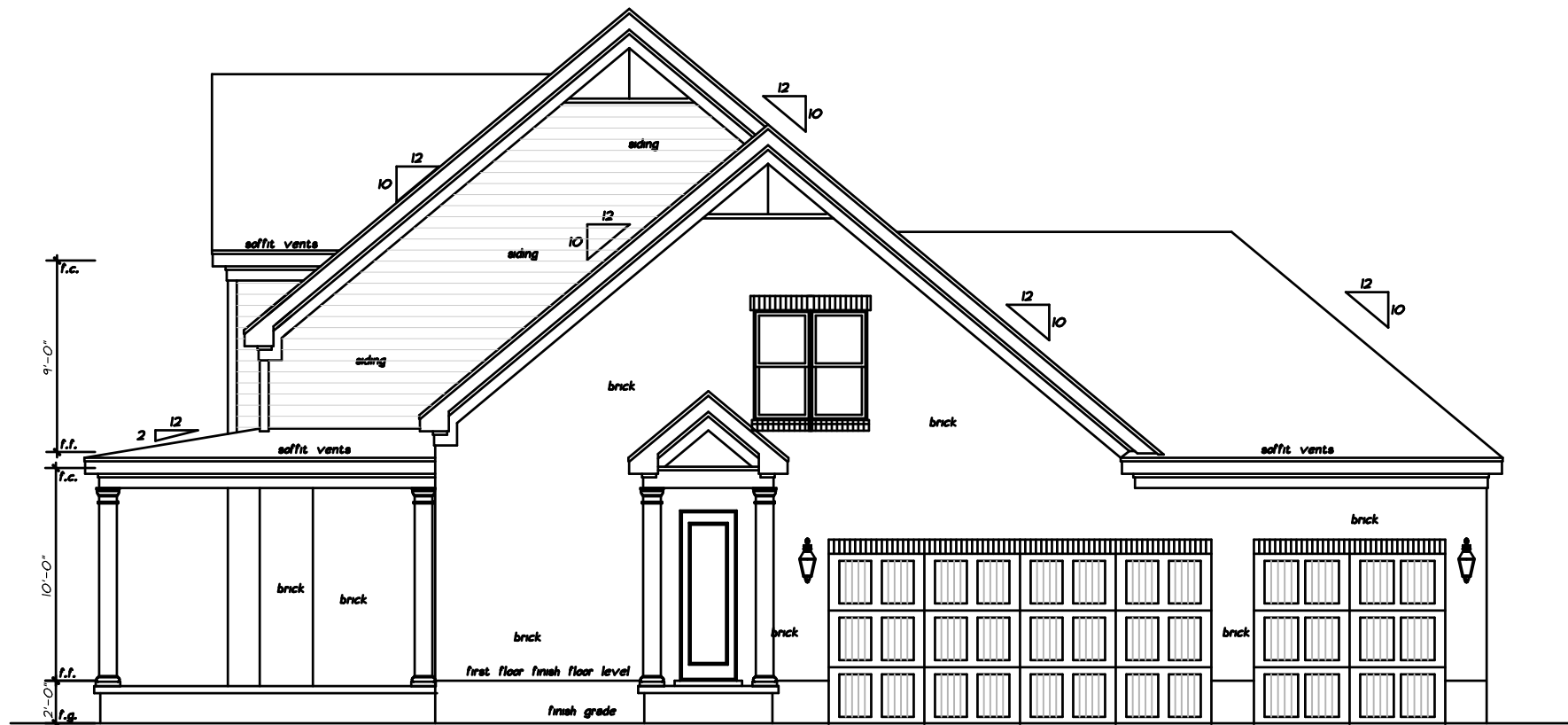
right elevation scale: 1/4" = 1'-0"