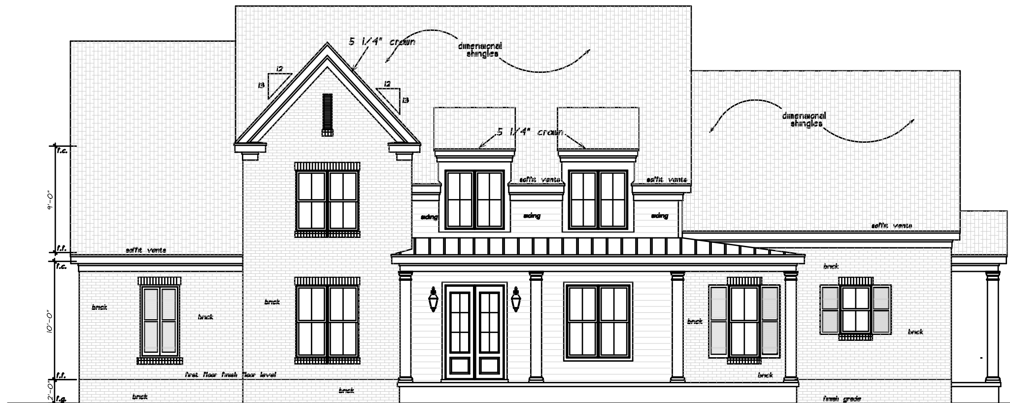
front elevation scale: 1/4" = 1'-0"